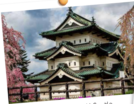
弘前城 / Hirosaki Castle