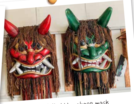
生剥鬼面具 / Namahage mask