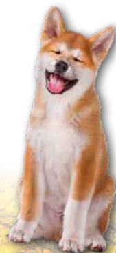
秋田犬 Akita puppy