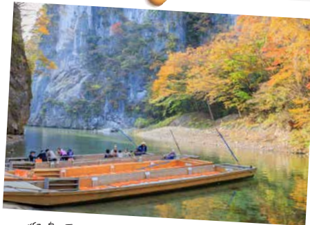
狛鼻溪游船 / Geibikei River Boat Ride